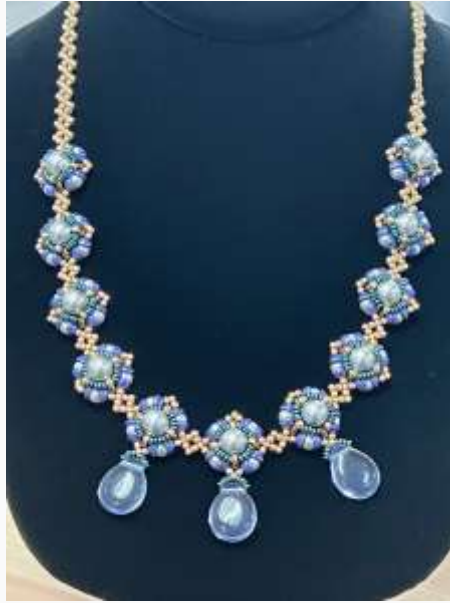
L'Amour Necklace Advanced Beginner Wednesday March 9 $45.00 Class and Kit

This class will be taught all day, so pop in when it's convenient for you. I'm here till 7. This is also component based and you will learn a weaving technique to complete a chain.